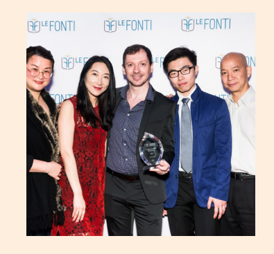
EXCELLENCE OF THE YEAR FILM PRODUCTION CHINA

For being the only official integrated healthcare platform endorsed by the Ministry of Health and for entering into prestigious partnerships with institutions such as the Malaysian Social Security System, Siloam Hospital Groups, the largest hospital chain in Indonesia, and the world's largest jewellery chain retailer, Chow Tai Fook.