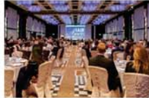
The IAIR AWARDS 2014 in Hong Kong

Corporate Social Responsibility, Cleantech and Green Building were the protagonists at the IAIR GLOBAL AWARDS®, held in Hong Kong at the Sheraton Hotels & Tower on the 28th of February, 2014.