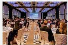
The IAIR AWARDS 2014 in Hong Kong