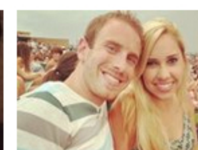
Hotel fills guest's ridiculous special