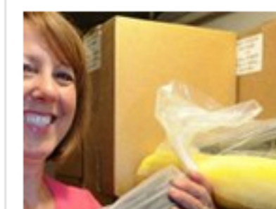
Principal's alternative to candy sales takes