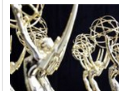
65th Primetime Emmy Award nominations