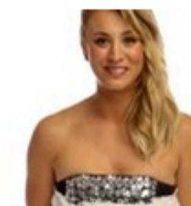
Would you recognize Kaley Cuoco from 10