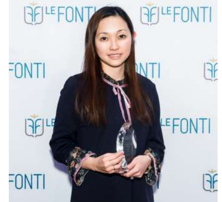
Chow Tai Fook