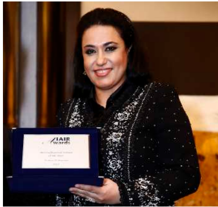
Nashwa Al Ruwaini Pyramedia