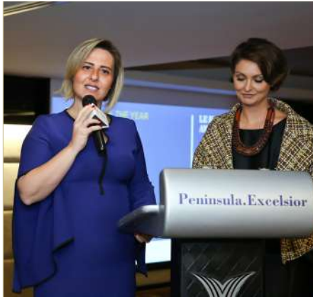
Sia & Moore Sia & Moore