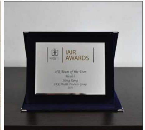
LKK Health Products Group LKK Health Products Group