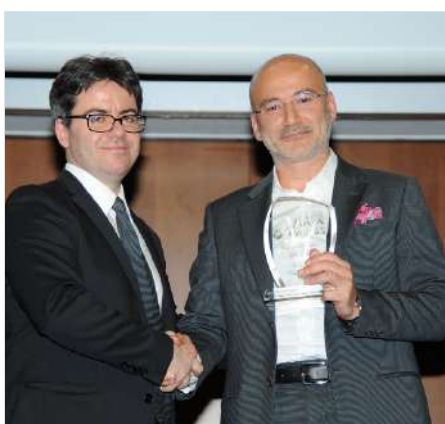
Yilmaz Yıldız Zurich Sigorta