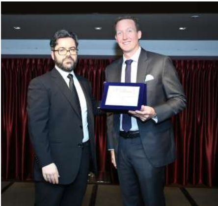
Trilliant Holdings Trilliant Holdings