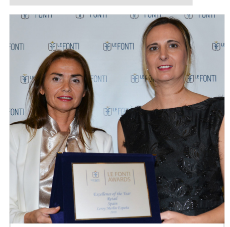
Leroy Merlin España