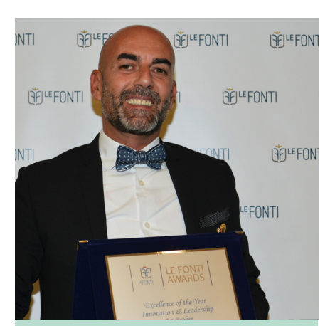
International Broker Art